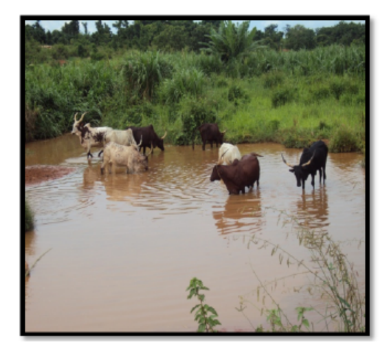
Figure 3. Pollution of drinking water source by cattle in Agogo traditional area

sometimes their cattle stray into people's farms but the farmers often kill the cattle instead of reporting the destruction to them. That is how the conflicts begin. Secondly, some farmers plant their food crops along walkways and river bodies attracting the cattle during grazing. Thirdly, some thieves come with sophisticated weapon to steal their cattle therefore the need to protect them. When they were asked why they did not fence their cattle as required of them in the agreement they signed with the traditional council, they indicated that the grass in those areas are getting finished while fencing require huge capital investment.