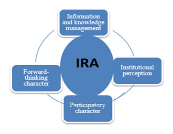
Figure 1. Conceptual framework: Institutional Readiness for Adaptation (IRAF) Framework.

All the data packages collections are based on the theoretical and conceptual framework below (Fig 1.).