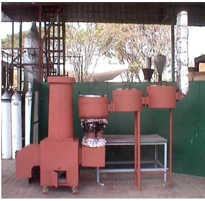
Figure 2. Fully assembled Gasifier Stove CGS3 with pot support